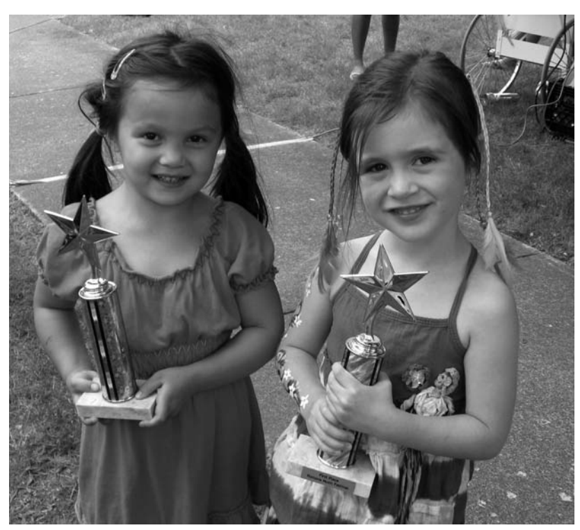
Pomona Idol Winners at the Festival on July 11, 2009

Want to see something else at next year's fair? Leave your thoughts (negative or positive) at festival@pomonavillage.com.